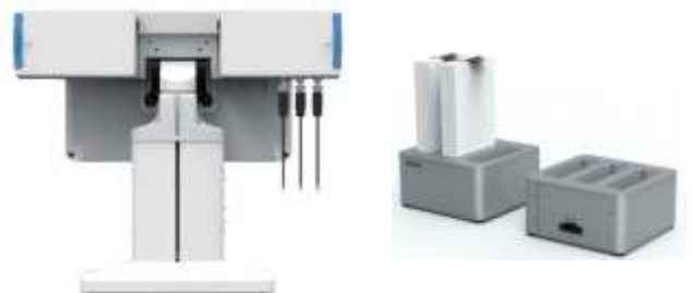
POC-615 with POC-IPSM90 Power System